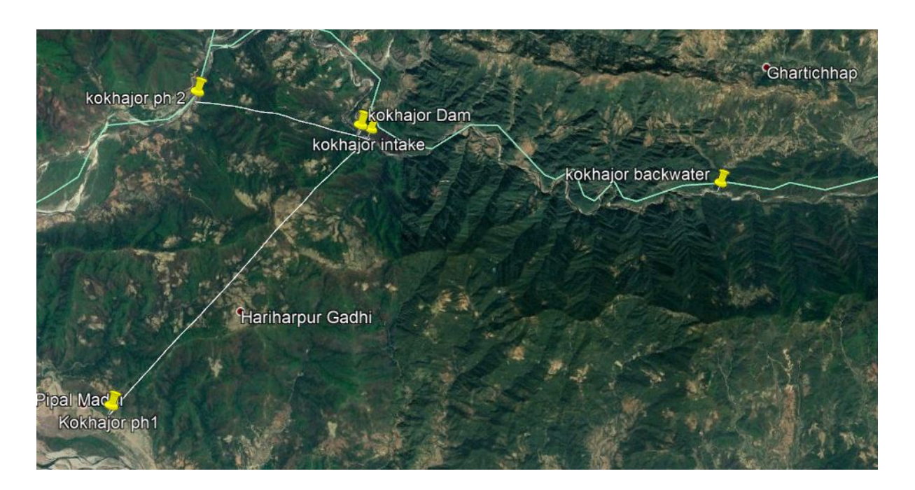
Figure 1 Proposed project location of Kokhajor Storage Hydropower Project in Google Map